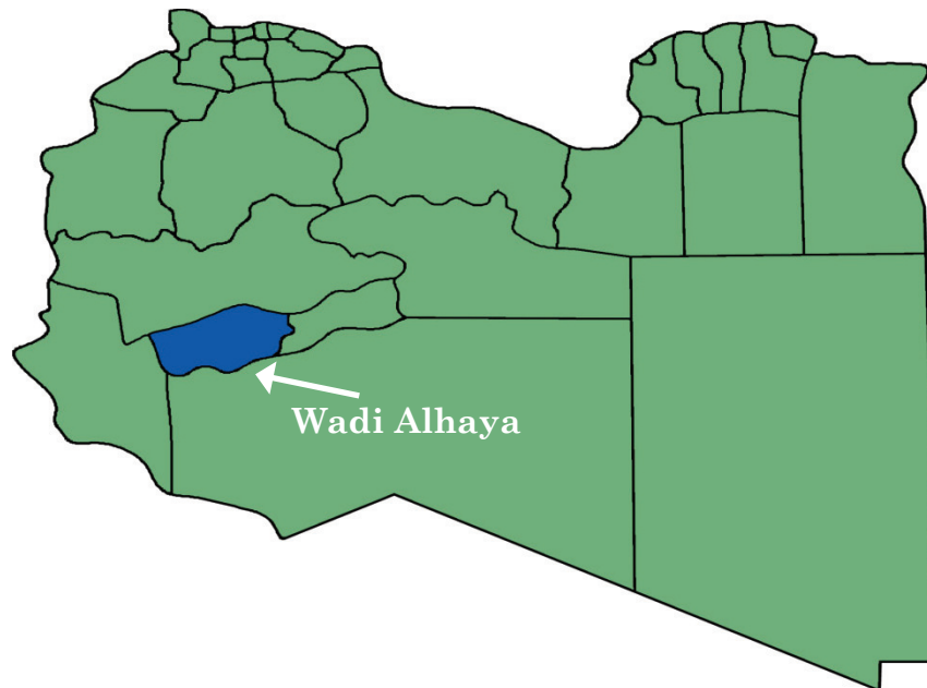
Figure 1 – Map shows the study area

The questionnaires were prepared in English language and then the researchers have translated it into Arabic language to ensure getting enough feedback because most of the contractors who are running their business there are mostly speaking the local language (Arabic language). Moreover, the data were collected by firstly using close ended self-administered questionnaires. And then, this study was employed survey method to obtain the perceptions of the respondents toward the critical success factors for construction projects in Libya. Out of the 80 administered and only 44 useable questionnaires were returned, which produced 52.5% responds rate which is a quite high when compared with previous studies. The collected data were analyzed with aid of Statistical Package for Social Science (SPSS) version 17.0. The data were analyzed in the following order. First, the demographic profile of firms and respondents were analyzed using descriptive statistics. Followed by, indices the Relative Importance Index (RII).